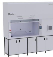
INTE-FLOW Range Laboratory, Acid Fume Cupboards with Integrated Fume Scrubbers